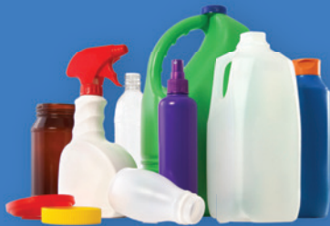
PLASTIC BOTTLES & JUGS #1, #2, #5 (2-1-5 Philly!)